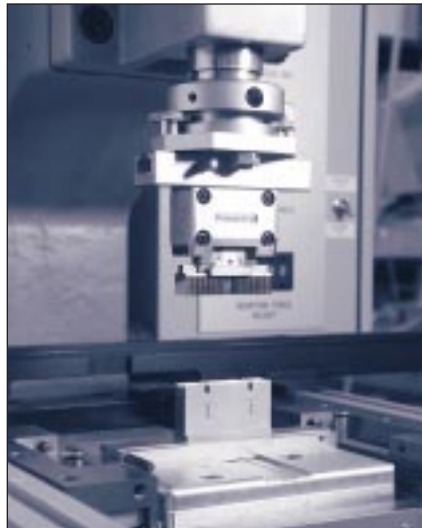
MALE Z-PACK 2 mm HM