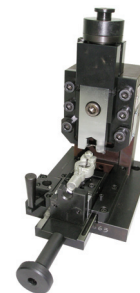
Loose Piece Applicator